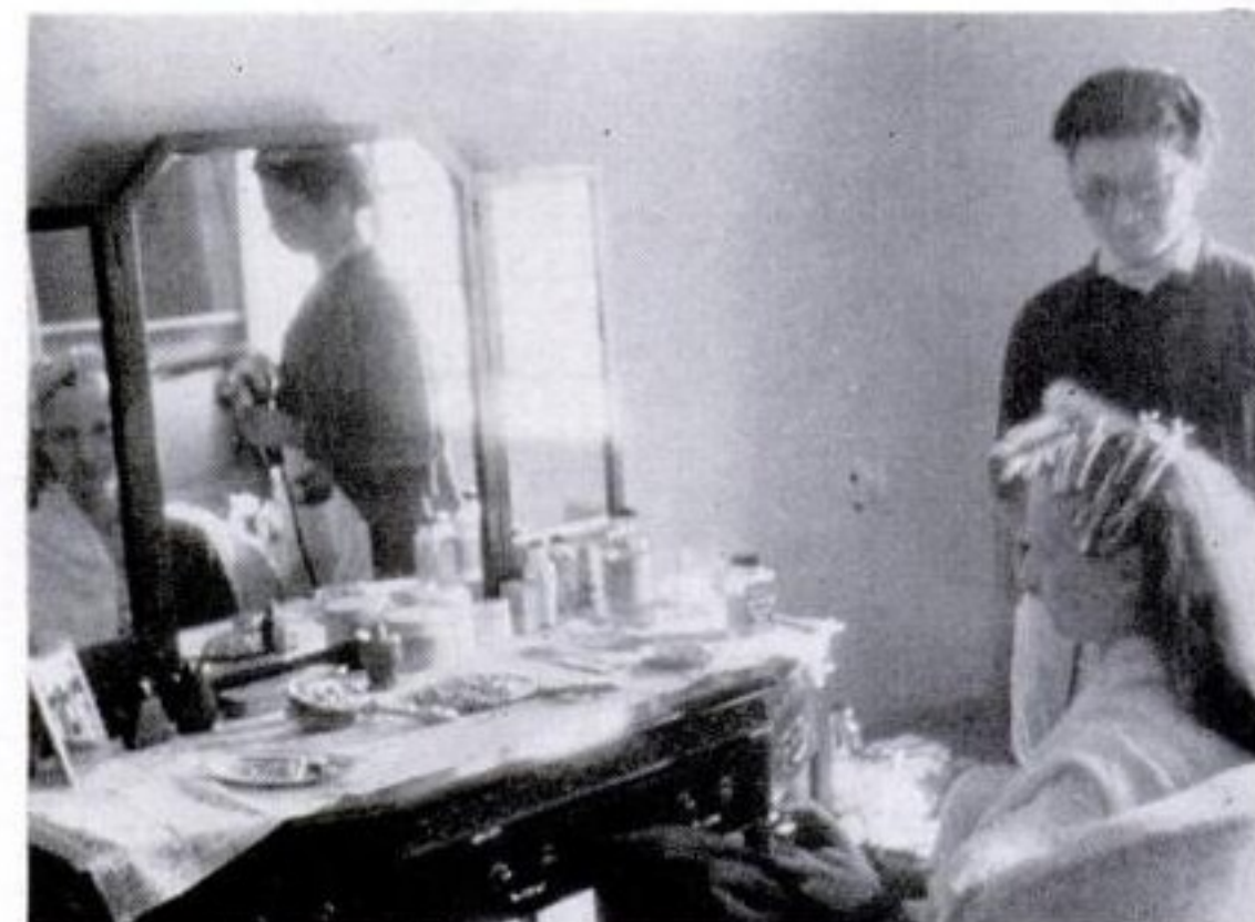
CONFINEMENT FORCED THE STAFF TO CALL IN HAIRDRESSERS AND BARBERS