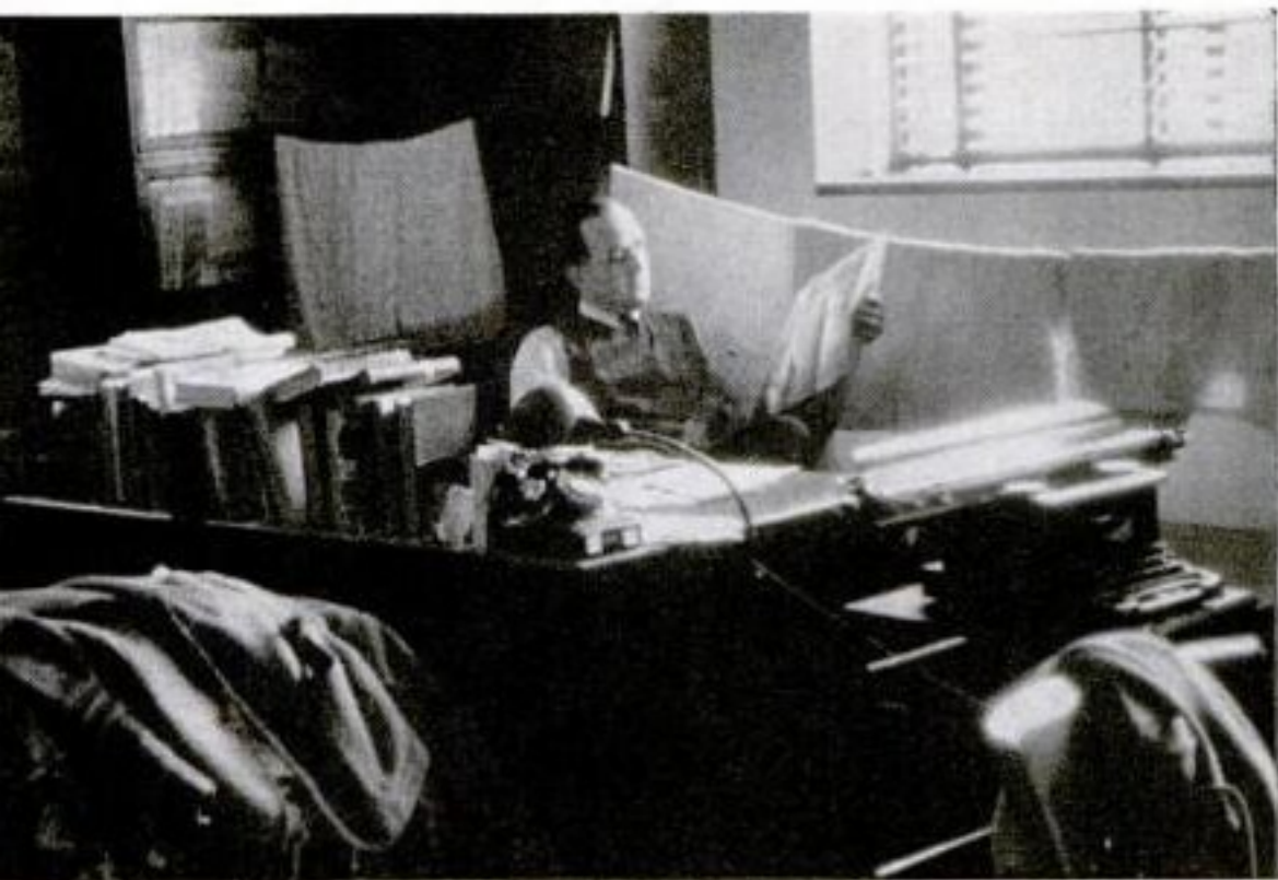
EMBASSY ATTACHÉS SLEPT IN THEIR OFFICES, DID THEIR OWN LAUNDRY (REAR)