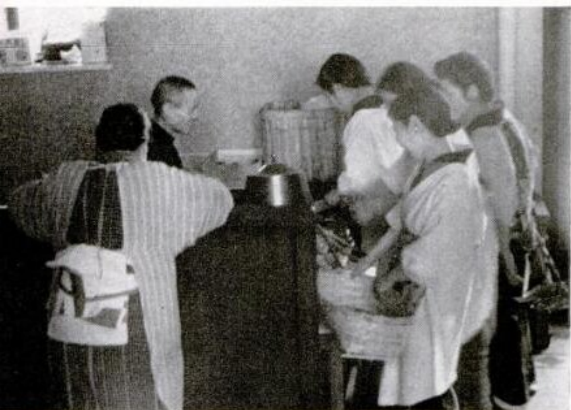
JAP COOKS CROWD TO GET DAILY FOOD RATIONS AT CHANCELLERY ICEBOXES