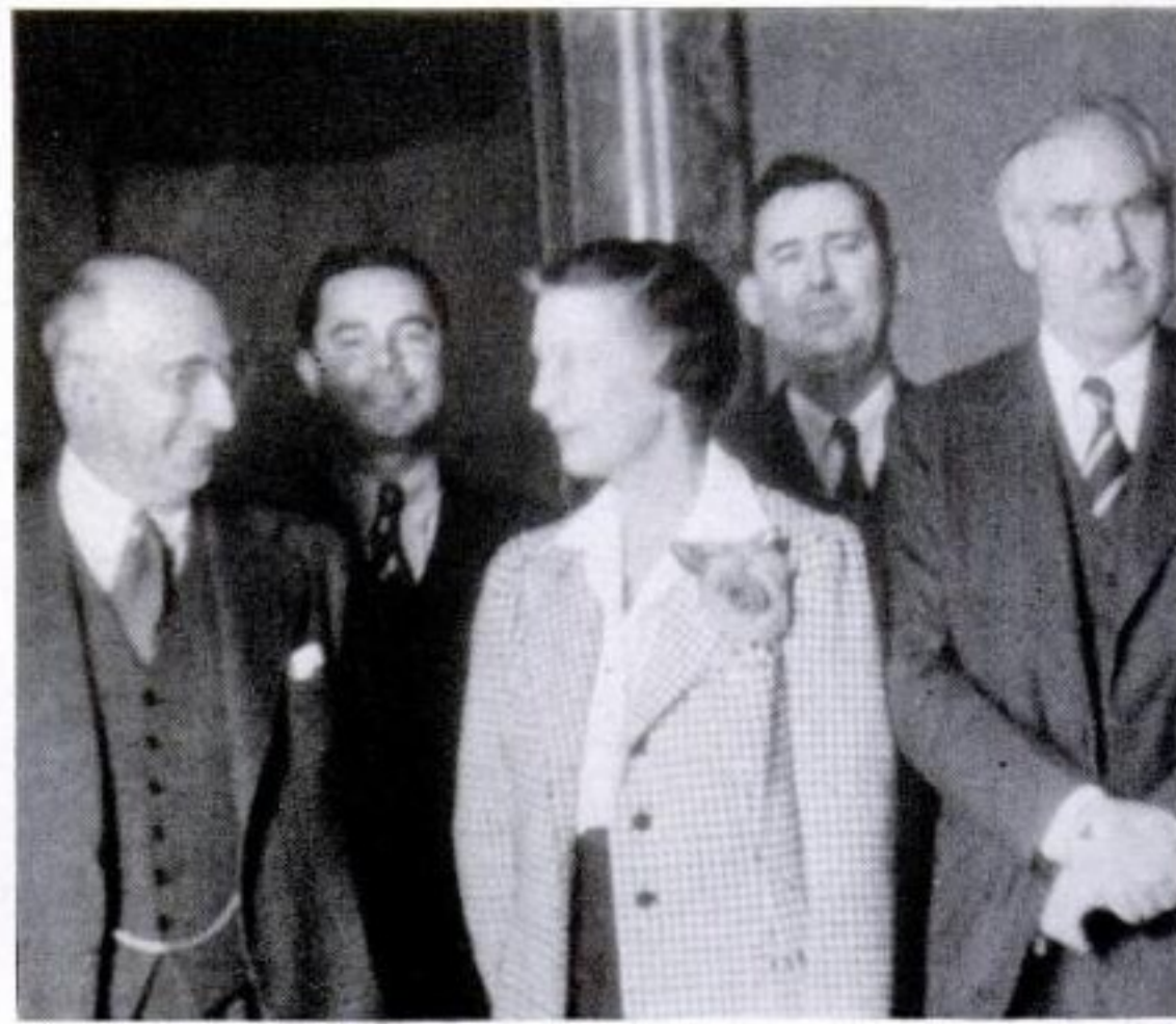
EMBASSY STAFF SING HYMNS ON SUNDAY, GROUPED AROUND AMBASSADOR AND