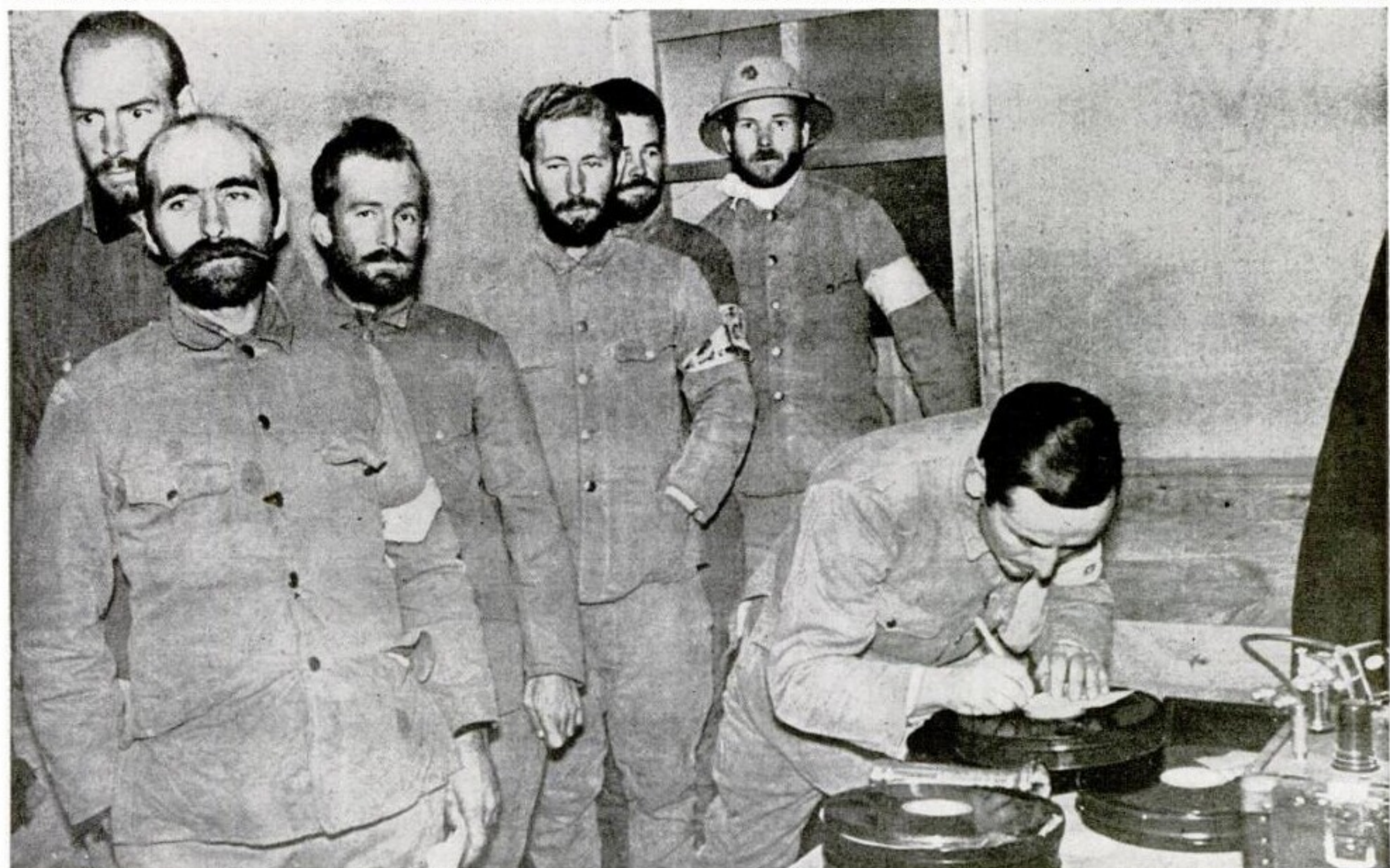
American marines speak their names into microphones, add "I am well. How are you folks at home?" and sign names on labels to be attached to phonograph records. Japs announced that

boatswain's mate and in rear a Navy officer. Jap magazine headlined this picture, "UNEXPECTED JAPANESE KINDNESS." The Americans look as though they expected no favors.