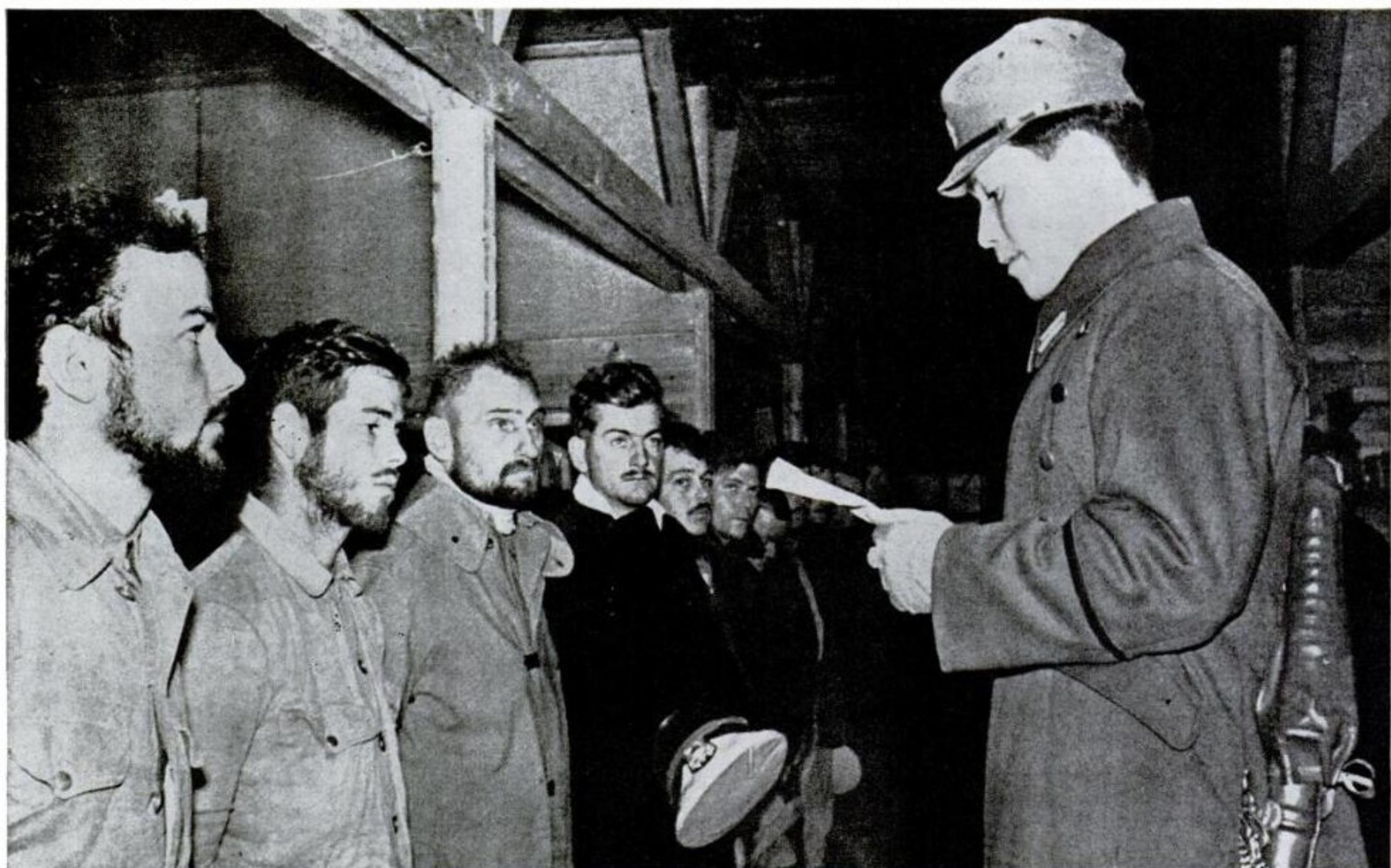
On raised platform, Jap propaganda officer reads out to Shanghai military prisoners at Woo-sung prison camp the bad news of Singapore. American prisoners at Shanghai include crew