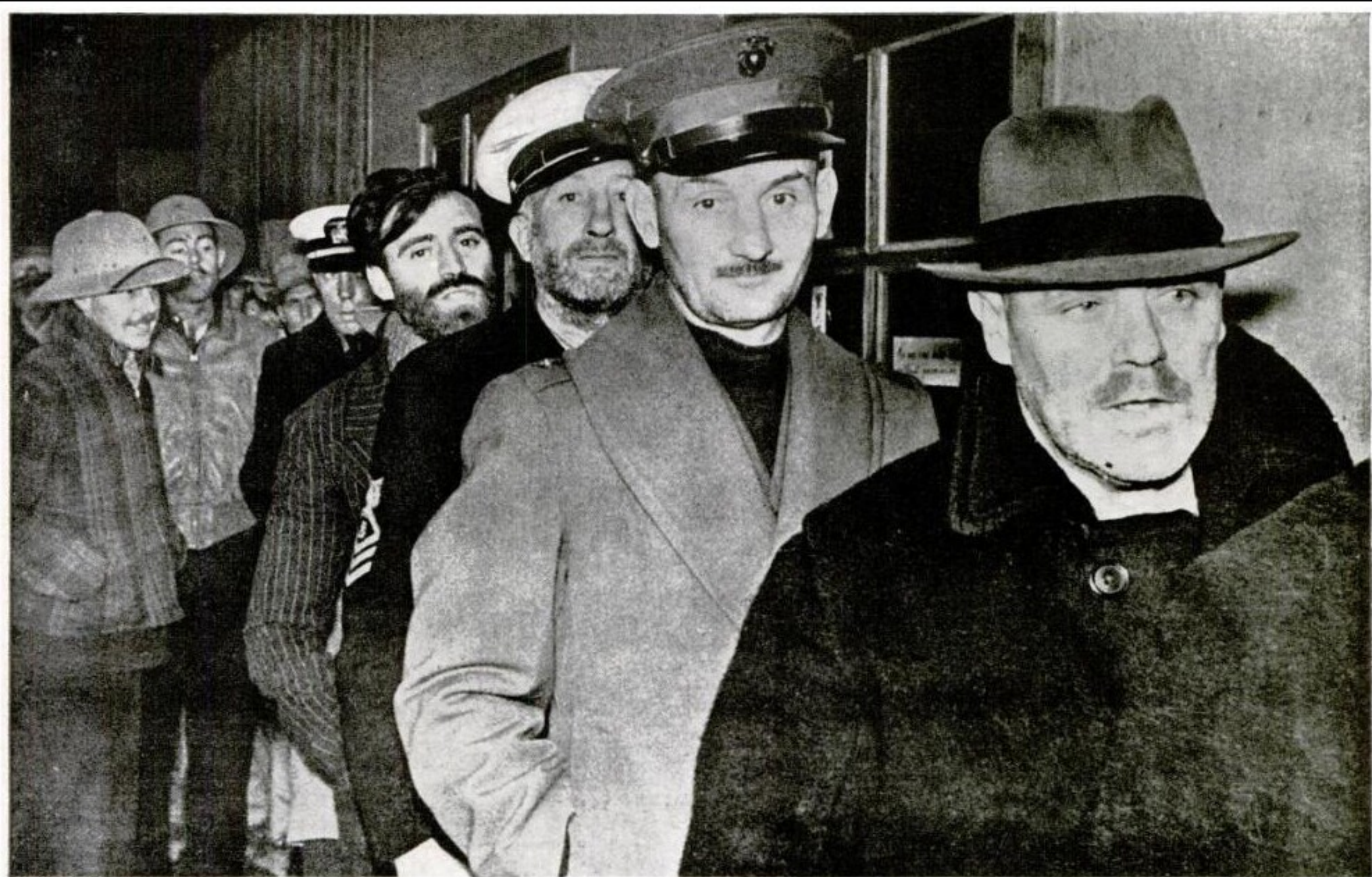
Americans line up for Jap routine of recording voices on Jap promise that the records will be broadcast to U. S. relatives. In this line are a U. S. Marines major, a grizzled U. S. Navy chief

boatswain's mate and in rear a Navy officer. Jap magazine headlined this picture, "UNEXPECTED JAPANESE KINDNESS." The Americans look as though they expected no favors.