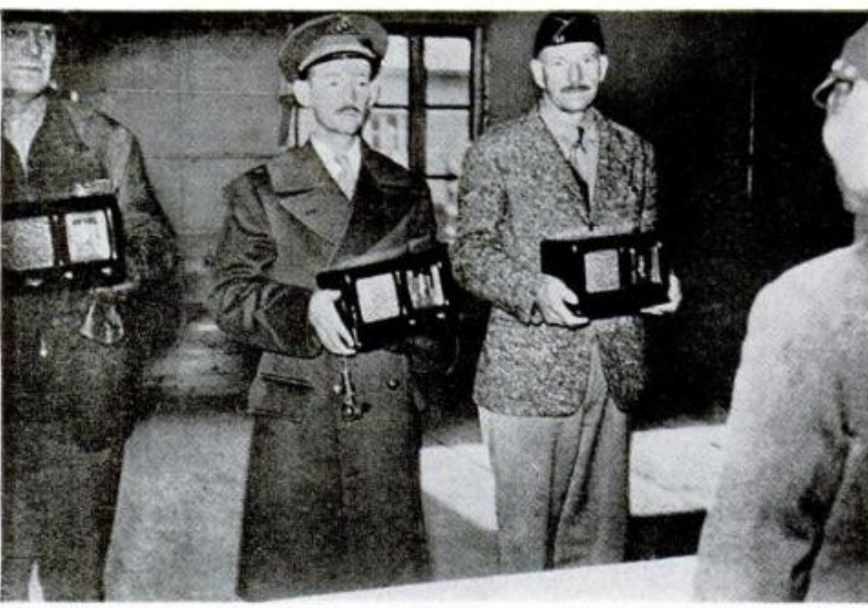
Ignominious chore is performed by heroic Major Devereux ( center ) of Wake Island, who has to stand at attention and be photographed receiving a radio from Japs for his co-prisoners. If he was allowed to keep it, it must have been one that tuned in only on Japan's radio station JOAK.