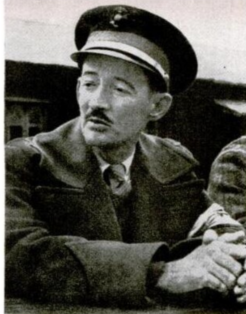
Major James Patrick Sinnot Devereux , hero of Wake, was officer who radioed, "The issue is in doubt," as overwhelming Japanese forces overran the last Marine defenses at Wake.