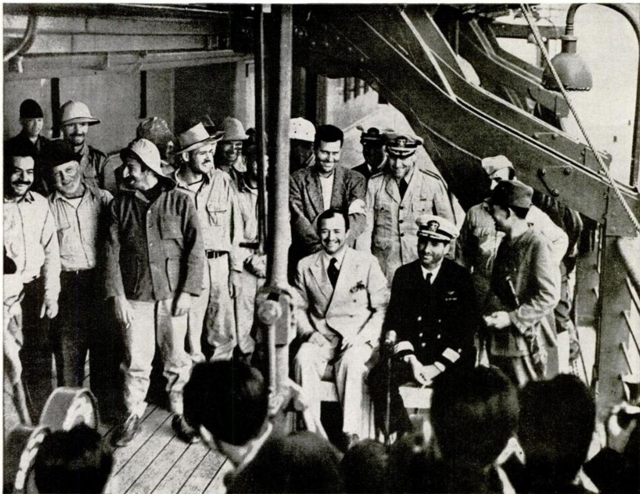
U. S. MARINE AND NAVY HEROES OF WAKE ISLAND LAUGH AT JAP CAMERAMEN ON SHIP TAKING THEM TO JAPAN. SEATED OFFICER IS COMMANDER WINFIELD SCOTT CUNNINGHAM