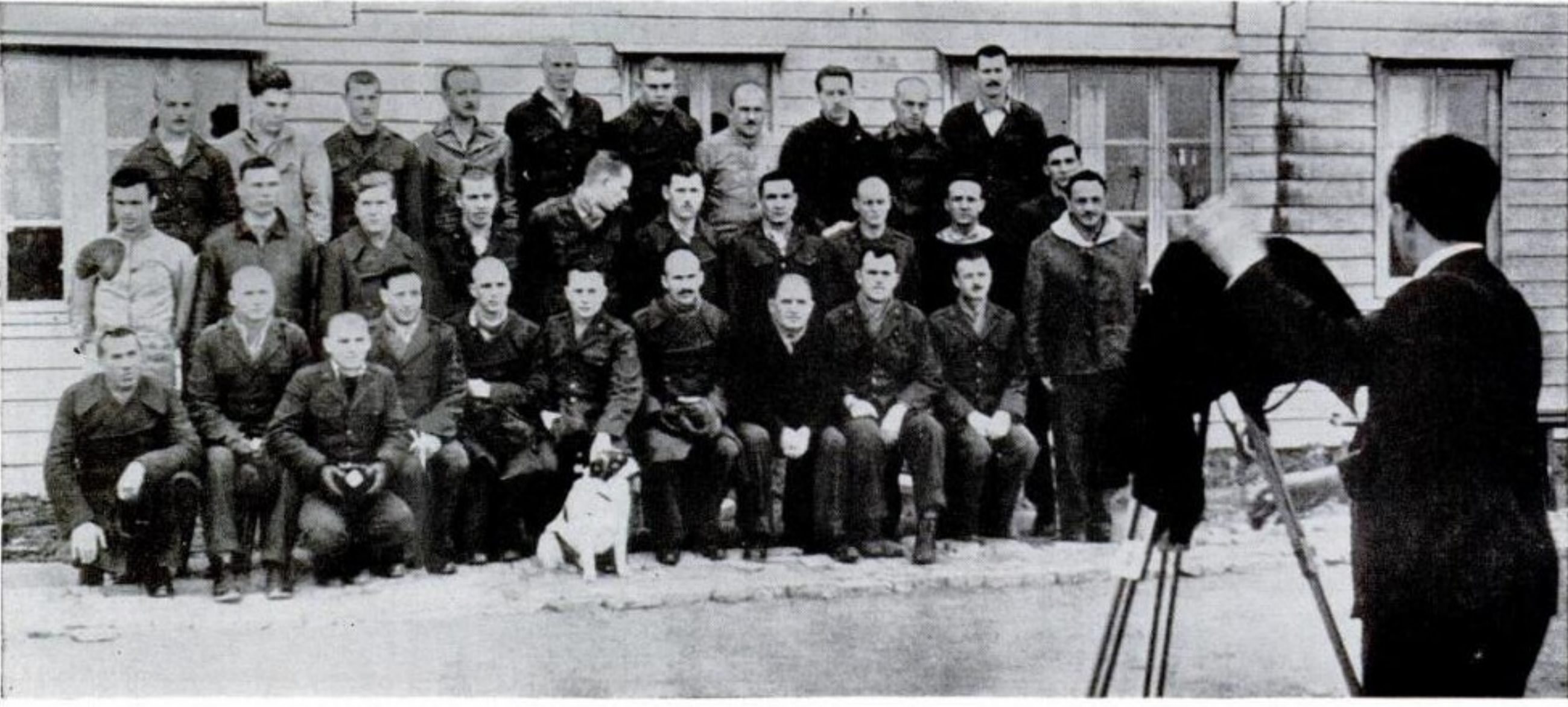
AMERICAN AND ENGLISH PRISONERS IN SHANGHAI CONCENTRATION CAMP POSE FOR OFFICIAL PHOTOGRAPH BY JAP PHOTOGRAPHER. JAPS ARE PROUD OF AMERICAN PRISONERS