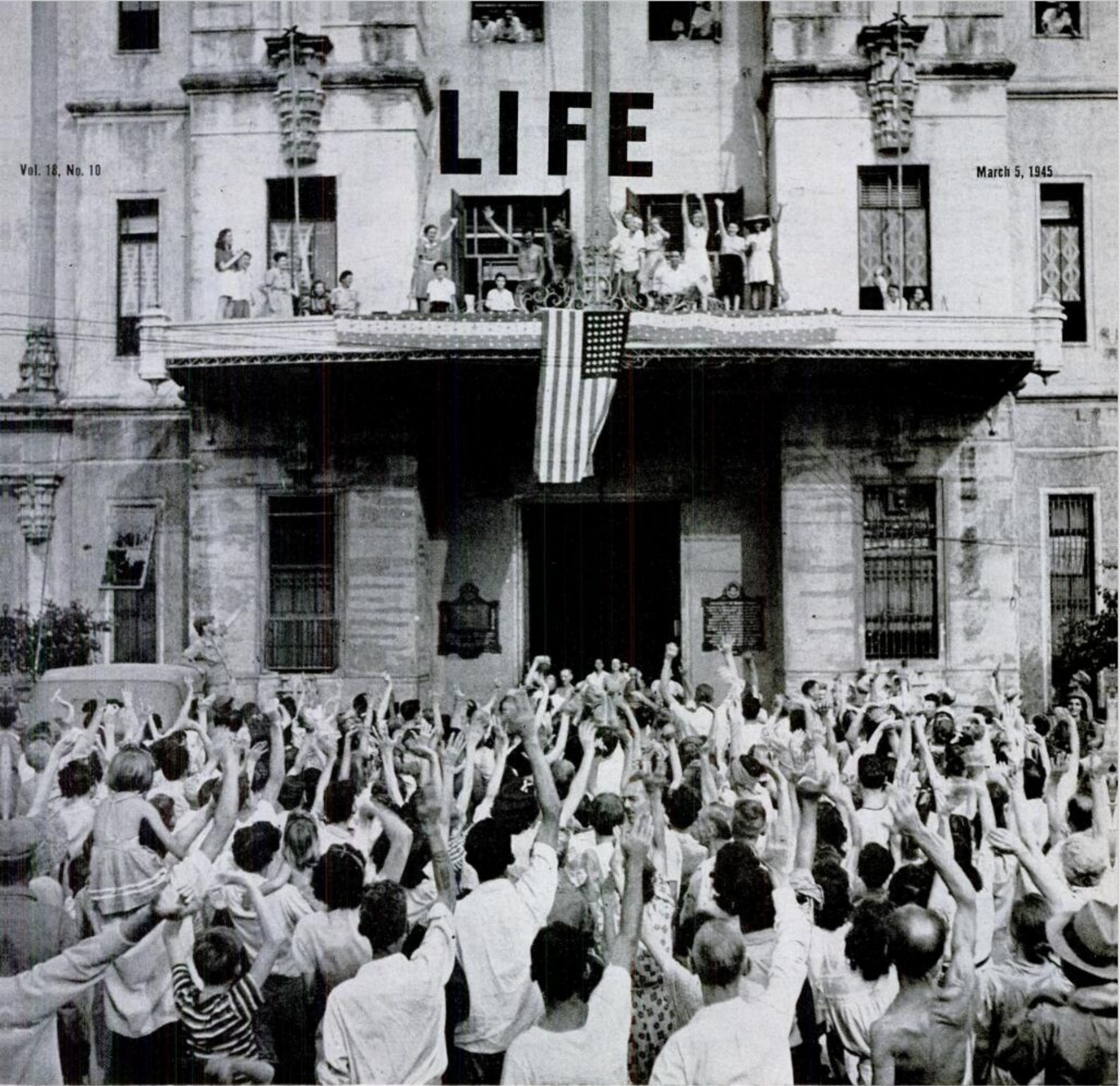
CRYING AND WAVING AS THEY SING, "GOD BLESS AMERICA," RESCUED INTERNEES OF SANTO TOMÁS HANG OUT THE FIRST AMERICAN FLAG THEY HAVE SEEN IN 37 MONTHS