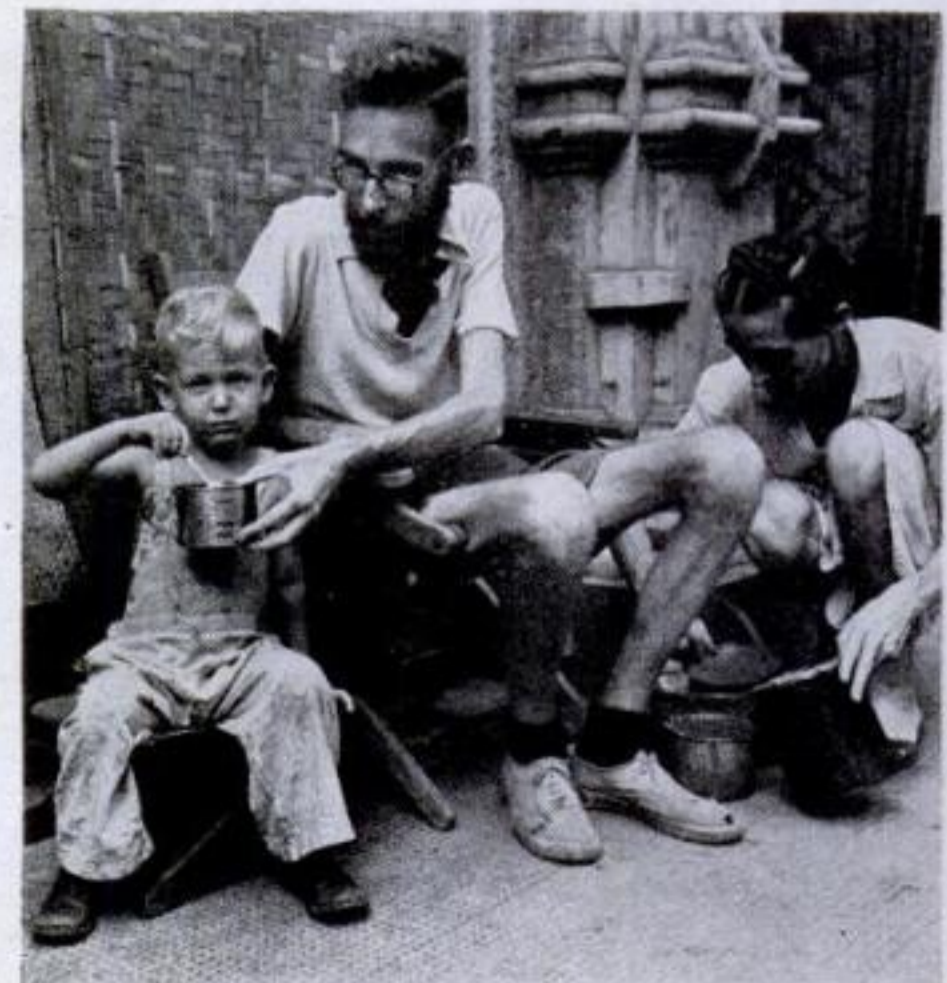
An emaciated father feeds his son out of a tin can. Note that the children, given the best food in camp, look better than the men or women.

Very few of the Americans interned in Santo Tomás plan to come back to the United States. Their home is Manila. Said one old man, "We know our boys are doing their darnedest to clear the Japs out of there, but we can't help wishing they'd hurry."