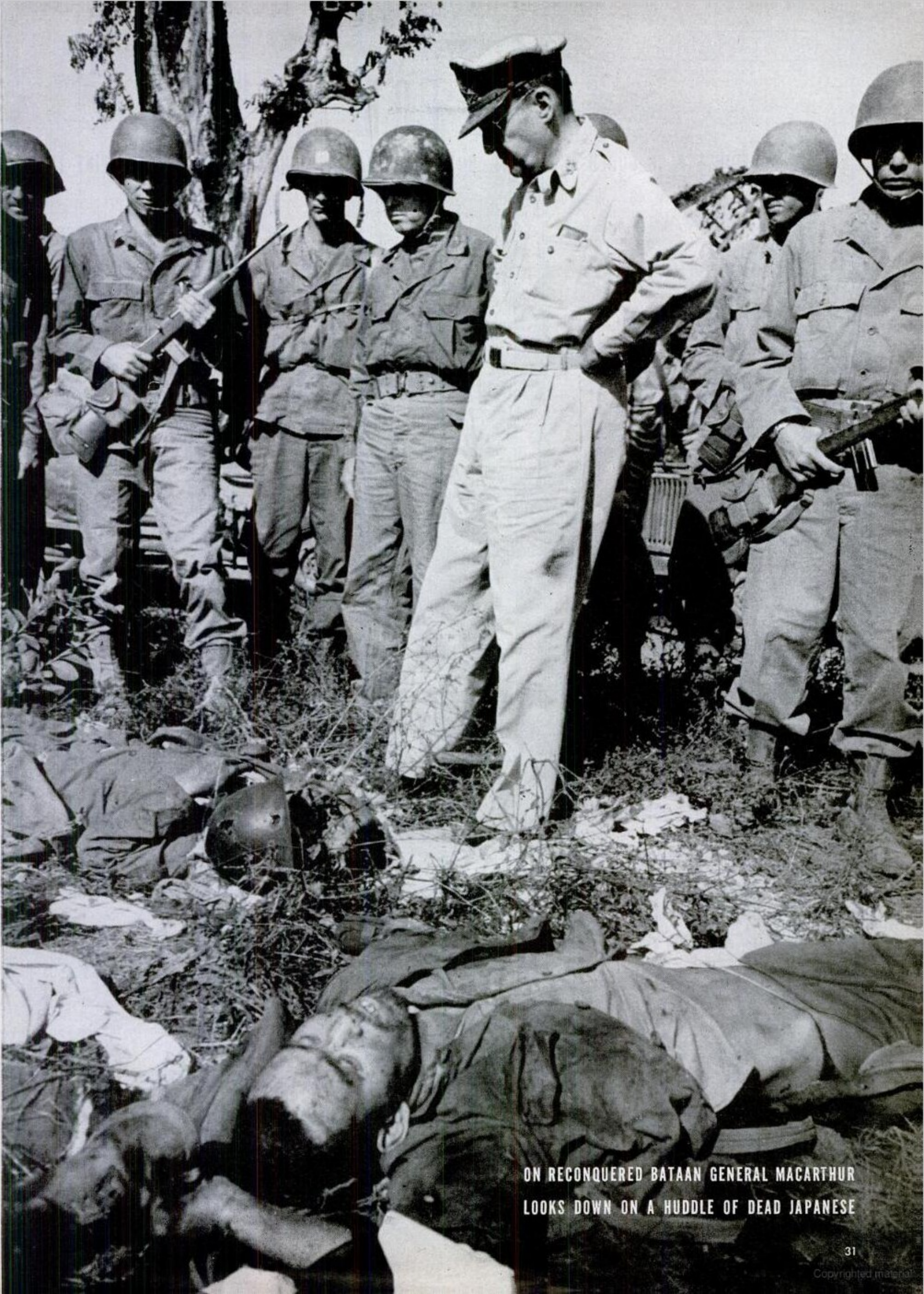
ON RECONQUERED BATAAN GENERAL MACARTHUR LOOKS DOWN ON A HUDDLE OF DEAD JAPANESE