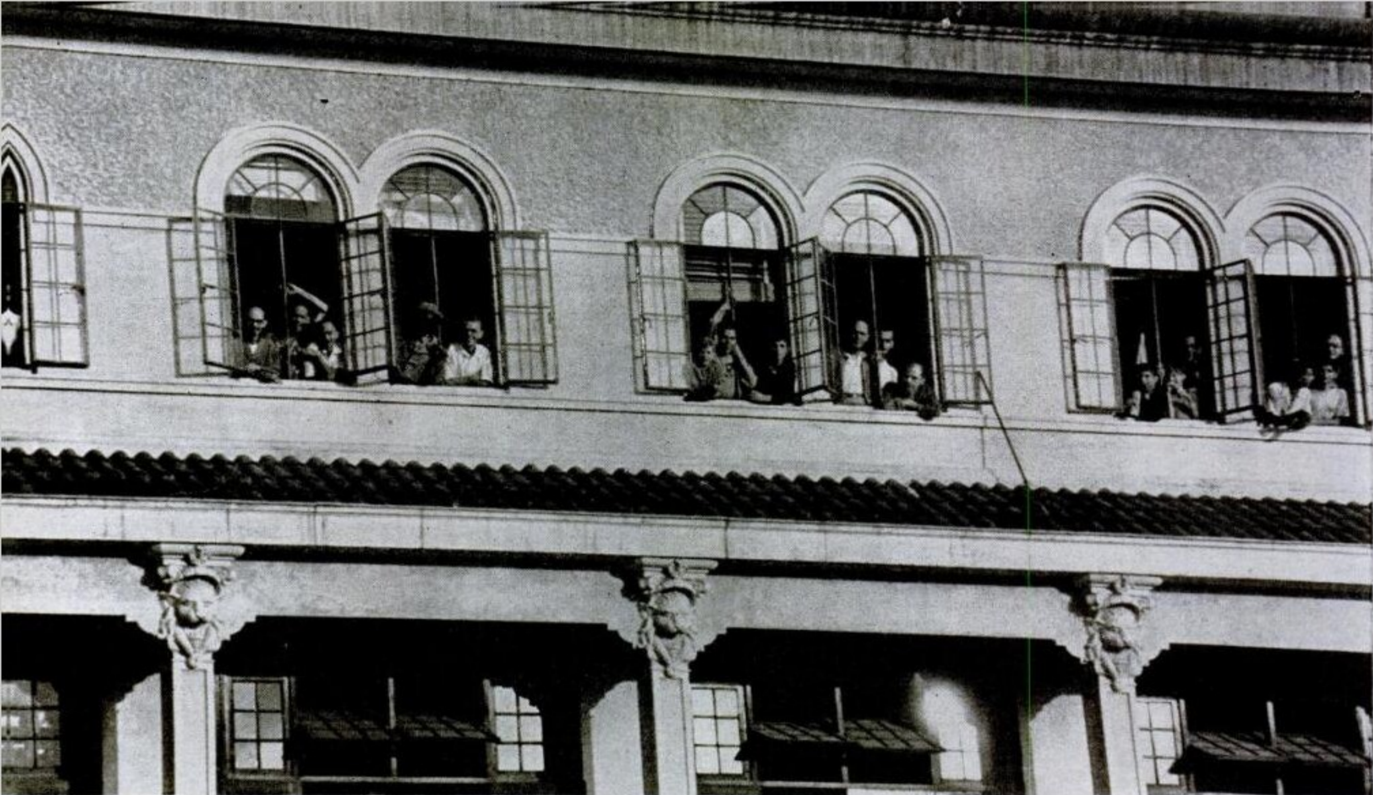
American hostages line the windows of Santo Tomás' Education Building on the morning after U. S. troops entered the university. Hiding behind the window sills on the floor below are