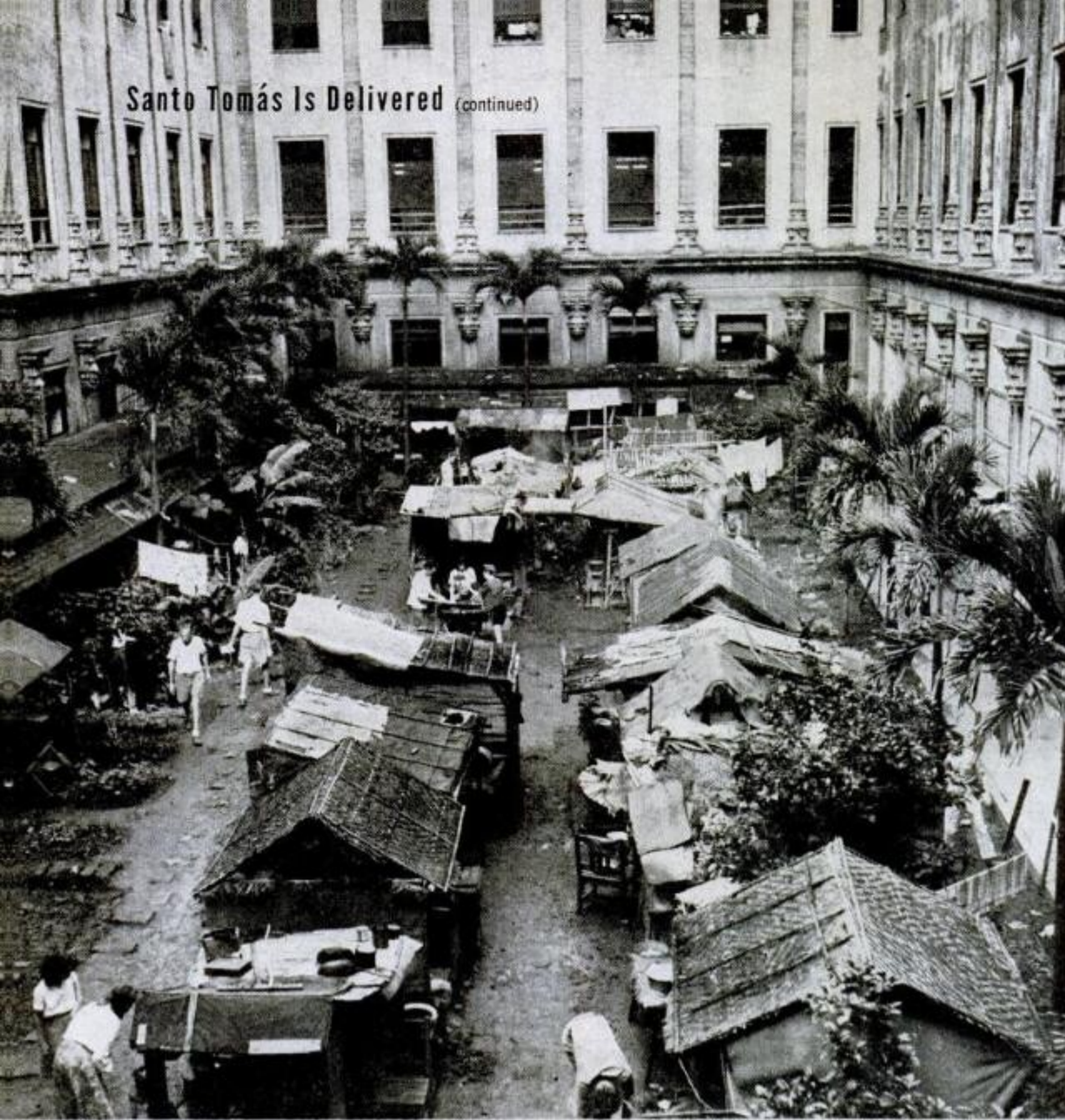
In the main patio the internees go on with the quiet routine of their prison lives while the Japanese are still holding out in the Education Building next door. Below is