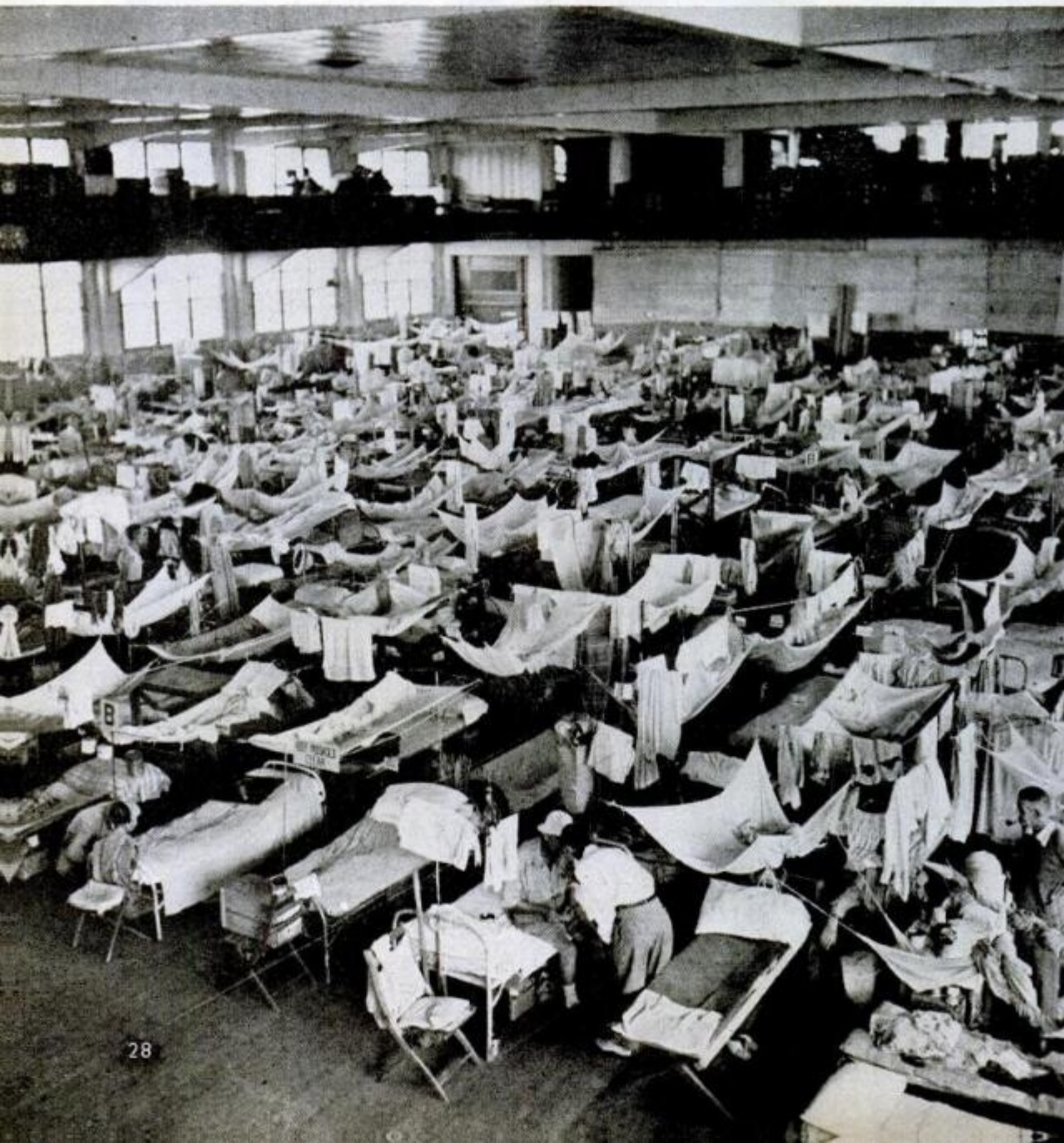
the university gym, where 400 sick old men live. Many of the men are too weak to leave their beds. Sometimes there were as many as 600 of them in this one big room.