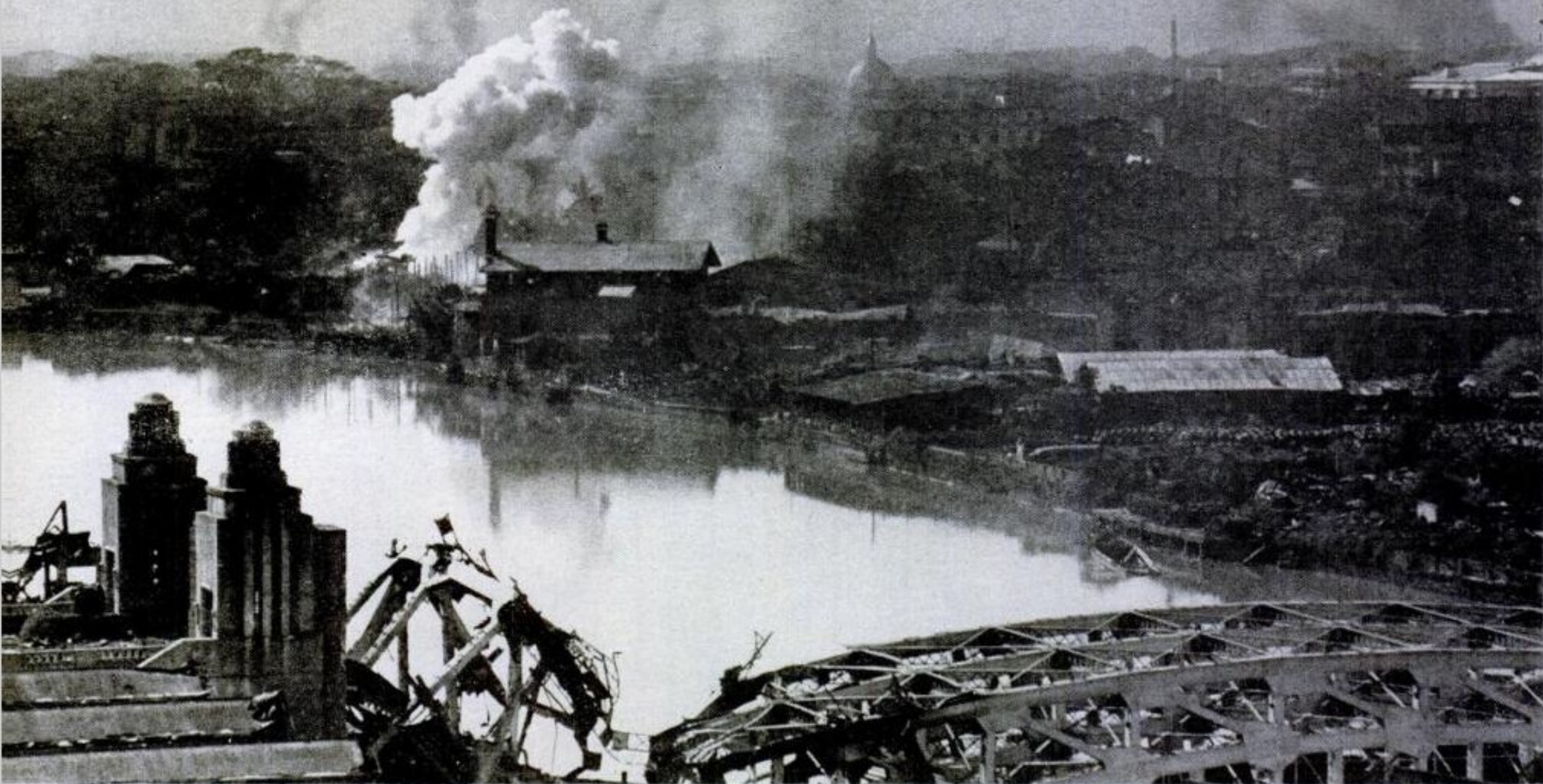
At the Pasig River, which runs through Manila, U. S. phosphorus shells drop among Japanese positions on south bank. In foreground is the Quezon Bridge, newest of four across the river.