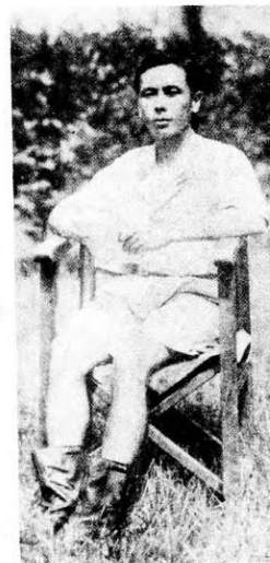
Captured photograph of diary's author.