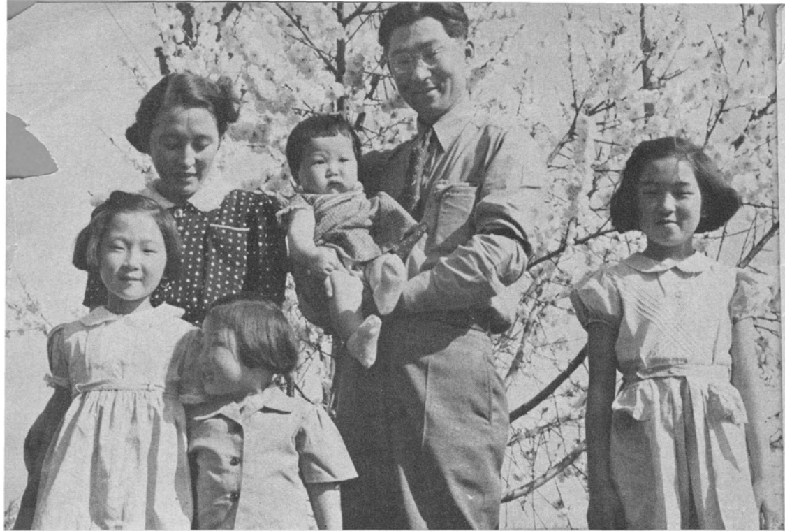
An American family of Japanese descent.

the latter part of March, it had become apparent that such a large-scale exodus could be handled effectively only on a planned and systematic basis. Accordingly, all further voluntary evacuation was halted by the Western Defense Command on March 29 and plans were initiated by WRA for establishing relocation centers with sufficient capacity and facilities to handle the entire evacuated population for as long as might be necessary.