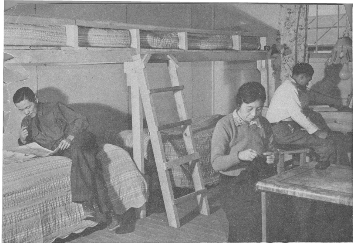
Improvements in family living quarters are made by the evacuees themselves from scrap materials.

The specific procedures being followed have been approved by the Department of Justice as sound from the standpoint of national security and have been endorsed by the War Manpower Commission as a contribution to national manpower needs. As the program moves forward, the costs for maintenance of the relocation centers will be steadily reduced.