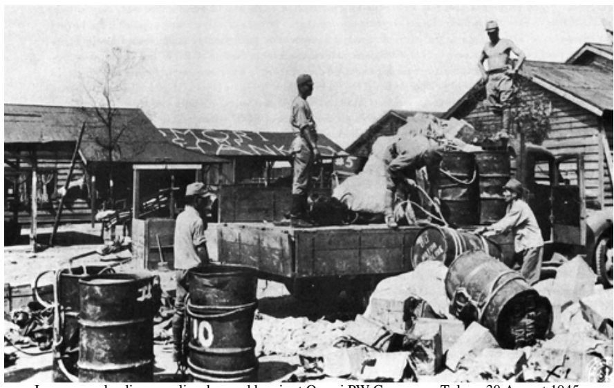
Japanese unloading supplies dropped by air at Omori PW Camp near Tokyo, 30 August 1945.