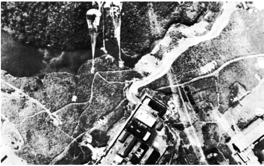
Sendai PW Camp No. 3 Relief Mission flown by 20th Air Force, 12 September 1945.