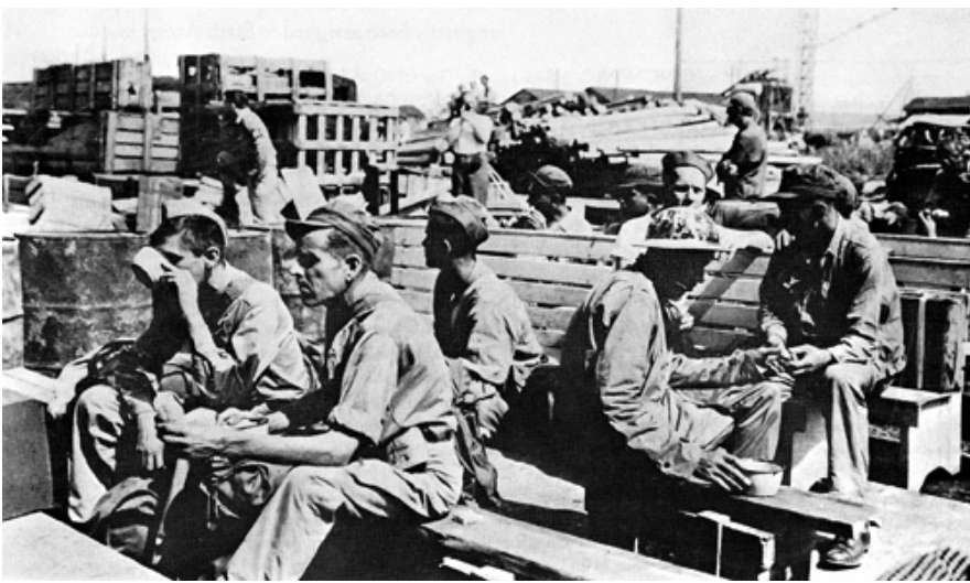
Recently arrived prisoners of war relax outside a warehouse on docks at Yokohama.