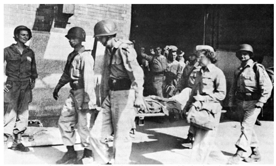
Prisoner of war, newly arrived at Yokohama Central Station, is carried to an ambulance by medics of the 1st Cavalry Division, XI Corps.