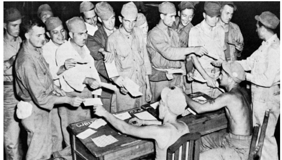
At Atsugi Airfield, Allied prisoners of war released from Toyama Camp bring letters to the American Red Cross table for postage and mailing back home.