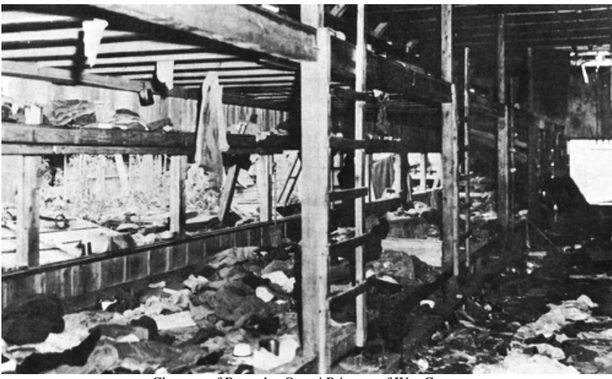
Close-up of Barracks, Omori Prisoner of War Camp.