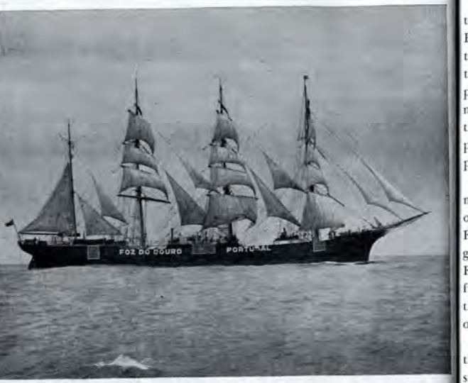
Carrying 329,788 Red Cross standard food packages for United Nations prisoners of war, the FOZ DO DOURO sailed from Philadelphia for Lisbon on April 28, 1943. She made the crossing in 21 days.

Each prisoner has at least one uniform in serviceable condition, and one good pair of shoes. The supplies of uniforms and miscellaneous articles of clothing coming from Red Cross shipments were reported to be ample. The prisoners of war, from among their own number, do the