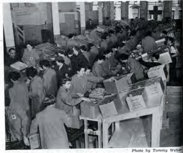
Conveyor line carries Red Cross food packages to gluing machine

The carton itself is a contai about 10 inches square and 41/2 inc