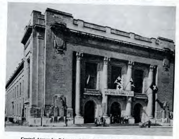
Central Agency for Prisoners of War, International Red Cross, Geneva

The carrying out of the provisions for sending in parcels and relief to camps, and for exchanging information between prisoners of nations at war and their own countries, is now a tremendous task requiring a large force. In Switzerland there are between 5,000 and 6,000 people employed by the I. R. C. C., chiefly on that job-the majority of them working as volunteers. Its mail averages over 60,000 pieces daily; its card index of 12,000,000 cards is said to be the largest in the world. If news seems to move slowly to you, please remember the enormous amount of detail work involved and the difficulties of transportation. Many people are trying constantly to improve this humanitarian service.