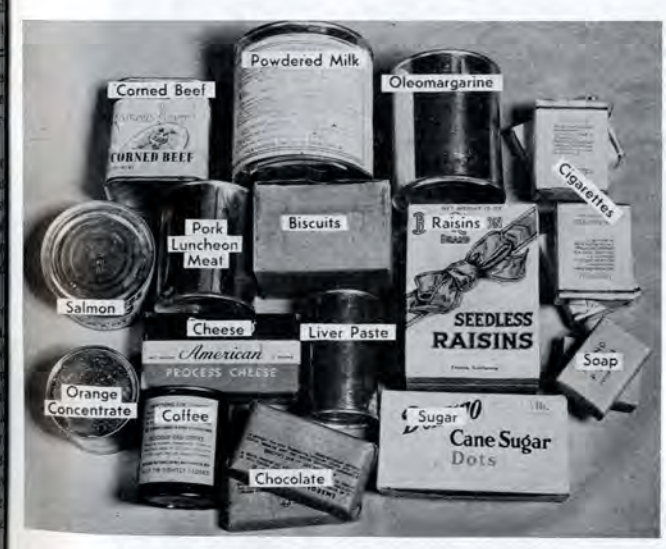
The contents of an American Red Cross standard food package

Besides the standard food packages, the supplies shipped included substantial amounts of bulk foods, medicines, tobacco and cigarettes, clothing, and a wide variety of comfort and toilet articles—not only for prisoners of war but for our growing number of civilians who are still being rounded up and interned in Axis-held territories. The miscellaneous clothing supplies included such articles as mufflers and socks produced