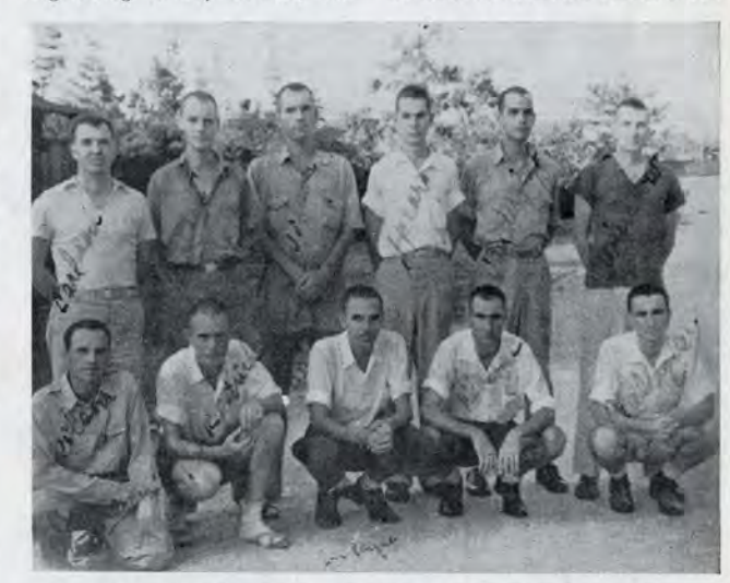
American prisoners of war at Zentsuji. This group includes five aviators from the U. S. S. Houston

Sports space is provided for baseball, cricket, and deck tennis, with a "gymnastic excursion" outside the camp once a week. Radio is available, for local reception, and a library of some 500 books was obtained from