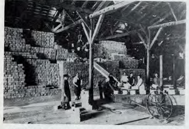
Prisoner of war relief packages leave International Red Cross Committee Warehouse in Switzerland for Axis prison camp

Another prisoner, recently cap-tured, writes: "There's really nothing that I actually need, but what I would like most are the following: a