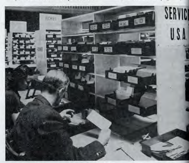
The Central Agency of the International Red Cross Committee at Geneva c indexes all prisoners of war. This picture shows the American Section.