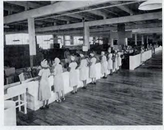
The Wm. Wrigley Jr. Company in Chicago using one of its assembly lines for packing prisoner of war packages for the American Red Cross.

This public-spirited action on Mr. Wrigley's part has been greatly appreciated by the American Red Cross, which was thereby able to augment its own assembly operations in Chicago during the month of May to the extent of 125,000 prisoner of war food packages-the total packed in Chicago during that month being approximately 300,000.