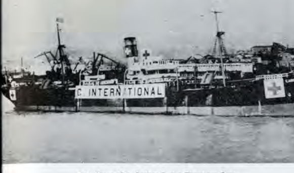
Red Cross ship Caritas I at a European Port.

and Italy. On this item alone isoner of war relief supplies, re-French and Swiss railways makently completed her maiden voyage important contribution to the rom Philadelphia to Lisbon, under of United Nations prisoners of pringuese registry, with a full cargo In view of the reduced volumemprising 329,788 standard food neutral trans-Atlantic cargo stockages. Arrangements have also available, and the pressure of the completed for a second sailing various Red Cross societies for sup-the former American-owned tional space as the number of prioring-to enter this service, and she ers increased, the International Oould Ioad her first cargo this sum-mittee asked the belligerent Poier. mittee asked the belligerent Porer. All prisoner of war relief ship-