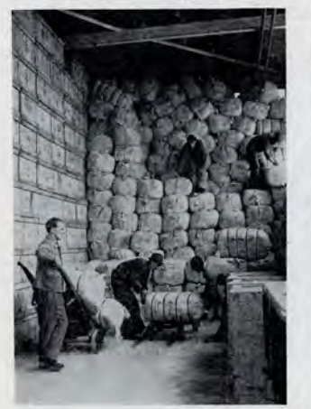
Bales and cases of clothing sent by the American Red Cross for prisoners of war are stored in bonded warehouses of the International Red Cross Committee awaiting rail transport from Switzerland to Axis

Decided improvement, the report concludes, has been made at Camp No. 59 during the past year. The grounds, however, are still muddy after rain, but work is now in progress to improve this condition. A British prisoner writing from this camp last fall said: "The country looks lovely, and it is a jolly good tonic to see such a sight, especially the thousands of bunches of grapes hanging on the vines. We can buy grapes, pears, tomatoes, melons, peaches, etc., in the camp canteen."