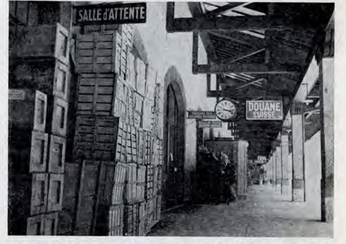
Swiss frontier station, once an important junction for international express and freight trains, is now used entirely for the storing and moving of prisoner of war supplies.

Although they are neither prisoners of war nor civilian internees, they are regularly receiving American Red Cross relief supplies. In due course, it is expected, they will be repatriated.