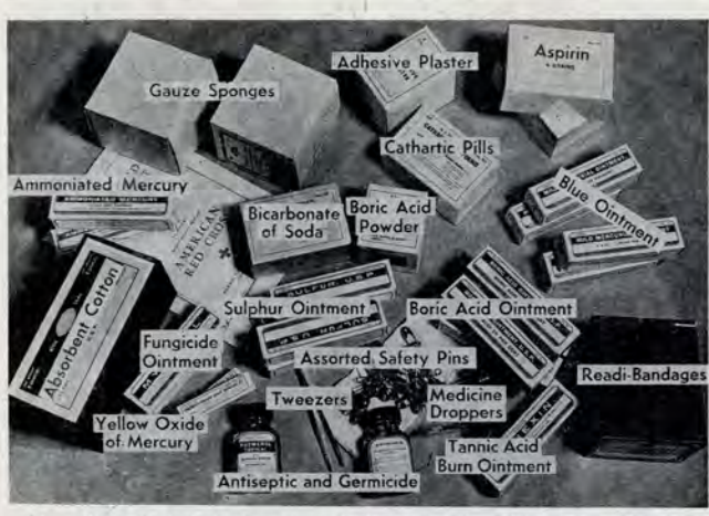
This medicine kit is designed to cover the first aid needs of 100 prisoners of war for one month