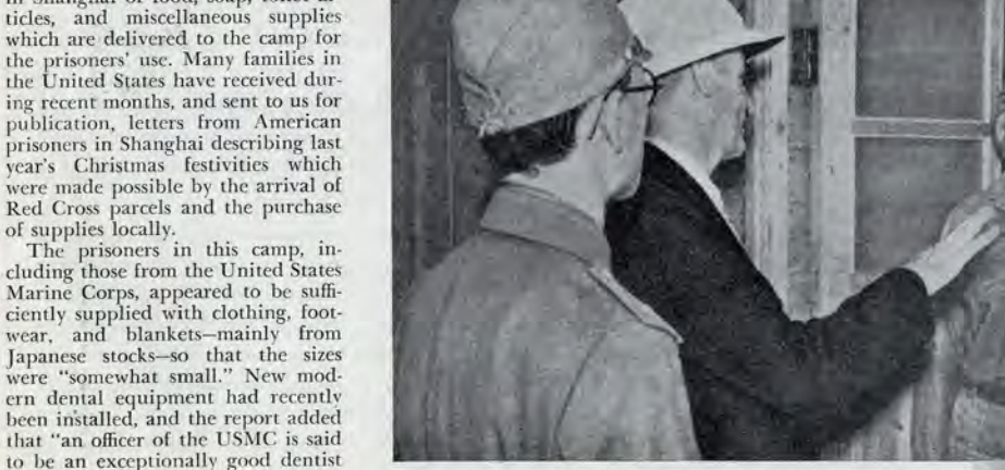
Under Japanese escort, the Shanghai Delegate of the International Red Cross Commi visits prisoner of war camps.

United States censorship regulations do not permit the embellished type of Christmas, birthday, and similar greeting cards to leave this country in prisoner of war mail. The reason for this is that the German and Japanese censors will not allow them to reach prisoners of war or civilian internees. A simple greeting card without embellishment, however, would be accepted by the United States censorship, and, insofar as Germany is concerned, would probably be delivered.