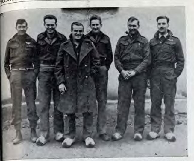
American "veterans" at Stalag Luft III. The wooden shoes worn by these flyers were issued by the German authorities. Many prisoners are said to prefer wooden to leather shoes for winter wear.

(Note: Many of the Japa "cambs" in industrial areas a to be merely barracks or built used for housing prisoners of rather than encampments. Ed.)