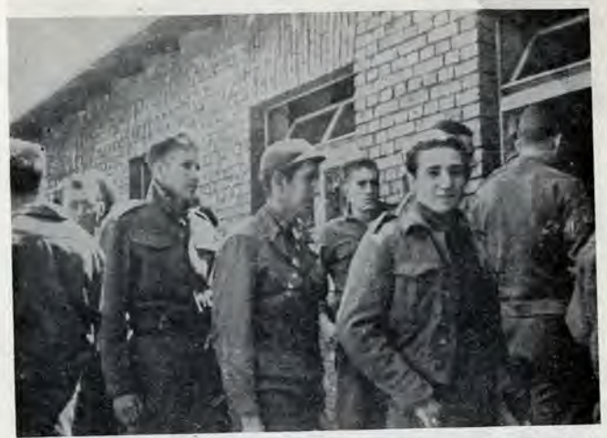
Americans at Stalag III B line up for "chow." The names of the men shown in this picture were not furnished to the American Red Cross.

Toward the end of 1943 a large umber of American prisoners of were assigned to Stalag XVII B, me of them having been transned from Stalag VII A, which is w being used mainly as a transit p. Stalag XVII B formerly conned Russian prisoners, and, as ere were no relief supplies for cricans on hand there, a shipment promptly sent from Stalag VII A. large consignment of standard on November 30 and reached ag XVII B on December 18.