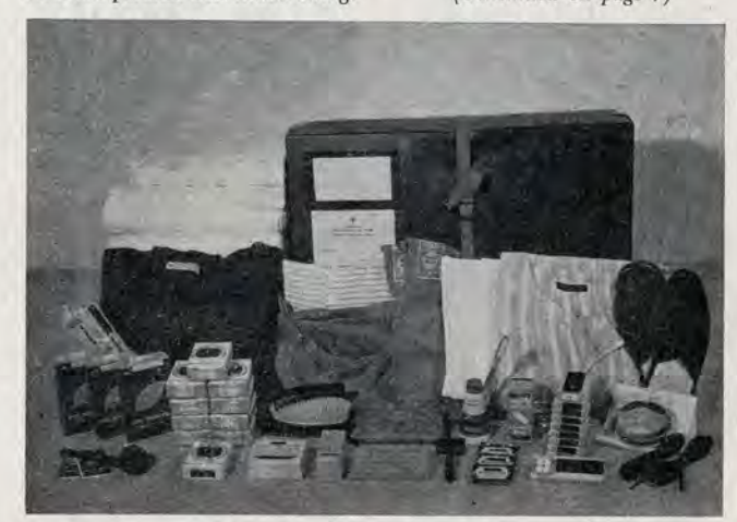
Ten thousand capture parcels have been forwarded from Geneva to camps in Germany for American prisoners of war, and a second shipment of ten thousand (contents as above) is now on its way from the United States to Geneva.