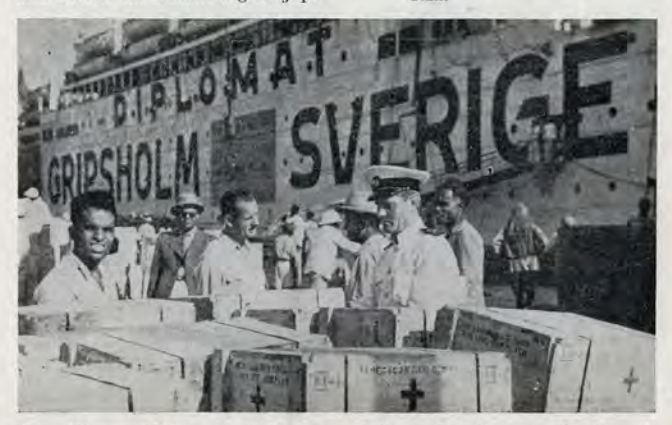
Transshipment at Mormagao, in Portuguese India, of Red Cross supplies from the "Gripsholm" to the Japanese ship, "Teia Maru."

Serials Acquisition The University of Texas Library Austin 12 Texas