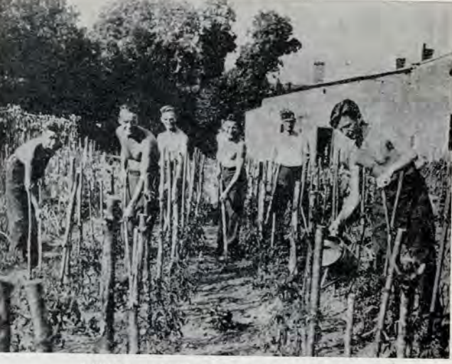
British prisoners cultivating tomatoes at Stalag XXI A.

Dear Family: This will be more good news for you at me. We are permitted two letters and four ards per month, so you'll hear from me once week from now on. We all are looking forand to our return as this life is very monot-