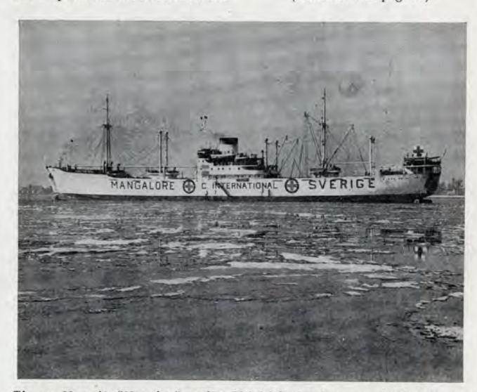
The new Motorship "Mangalore" reaching Philadelphia last January on her first crossing of the Atlantic

Postmaster-If addressee has removed and new address is known, notify sender on FORM 3547, postage for which is guaranteed.