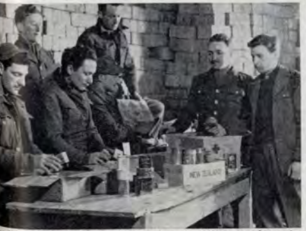
omining New Zealand and American Red Cross packages in the Vorlager.