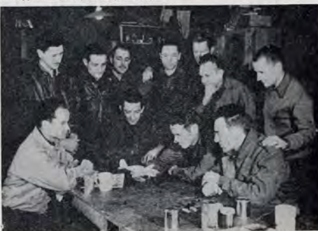
Prisoners study model planes made in the